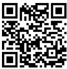
V110 3D Demo