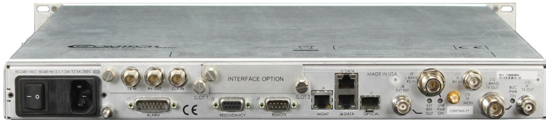
CDM-760 Back Panel